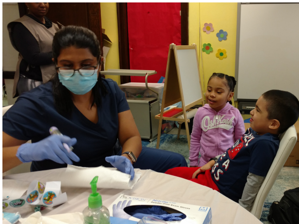
recurring 6-month site visits