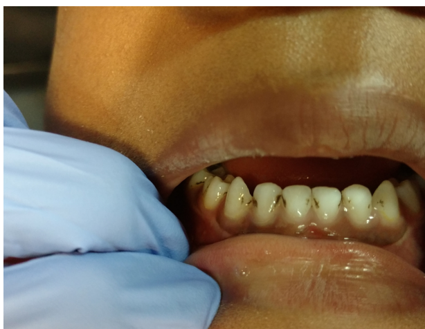
follow-up at dental home