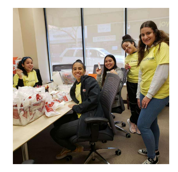
MLK Day of Service

We are grateful to The Horizon Foundation of New Jersey , The Montclair Foundation , Delta Dental of NJ Foundation , and Partners for Health Foundation , for their support of KSOHP