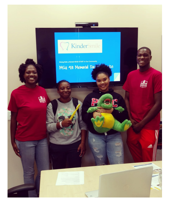
Montclair State University 9/11 Memorial Day of Service September 14, 2019 Bloomfield, NJ