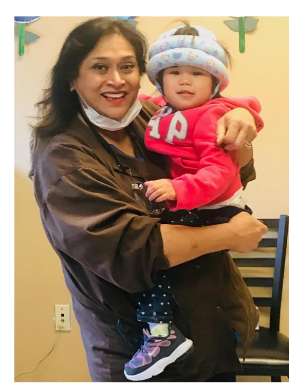
KinderSmile Oral Health Program Fall 2019 School Offsite Visits