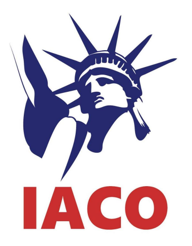
Immigrant Integration Day October 26, 2019 Passaic, NJ

KinderSmile Community Oral Health Center Trenton!