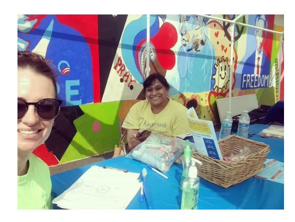
Nia Fellowship Baptist Church Community Block Party September 21, 2019 West Orange, NJ