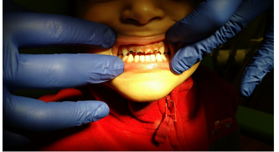
4 year old with baby bottle decay at a Montclair preschool.

I also have the most heartwarming news to share from Haiti ... Stay tuned!