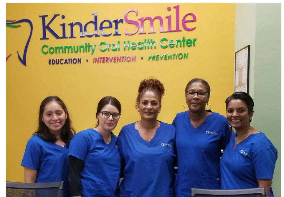
Click to meet the team.

Since opening two years ago, our "village" has grown immensely, and I am so proud to introduce all of the wonderful women in the article linked below.