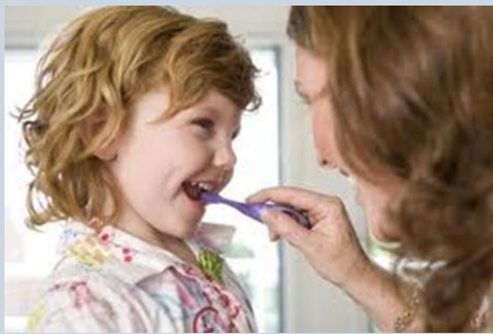
Child being taught proper Brushing techniques