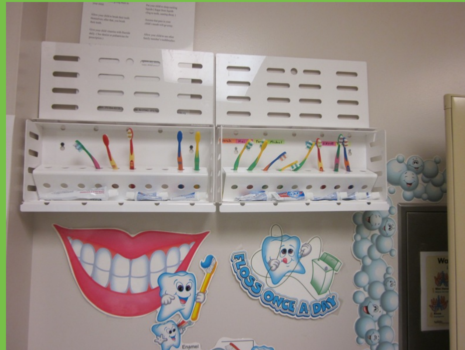
6 Toothbrush Stations have been installed at local pre-schools and the ARC of Mountainside,NJ.

for 500 children in the Mayan Indian villages. These volunteer members will serve in different capacities on the trip, but strive to accomplish a singular vision: to serve the dental needs of children. Thank you for your commitment and passion Jr. Board Members.