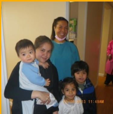
KSF Oral Health