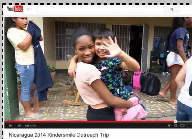
Nicaragua 2014 KinderSmile Outreach Trip