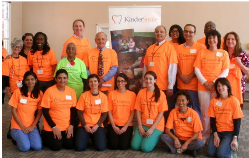
The entire 'GKAS' dental team.

We thank all our volunteers for their hard work and time to promote and improve the oral health of our children of Essex County, NJ. There is a mutual pride and dedication in our Community to help those in need. Collaborating as a team ensures that we can meet our goal.